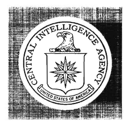
DIRECTORATE OF INTELLIGENCE