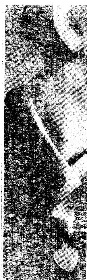
Symbolic of dangling to

The official added that the most unusual thing about the incident was,