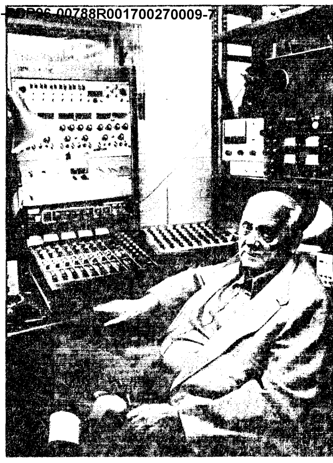
A\ MOTHER\ staffer\ tries\ to\ find\ out\ for\ himself\ whether\ audio\ technology\ can\ help\ induce\ .