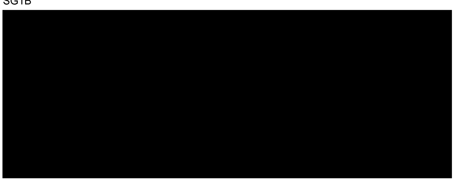
SECRET NOT RELEASABLE TO FOREIGN NATIONALS