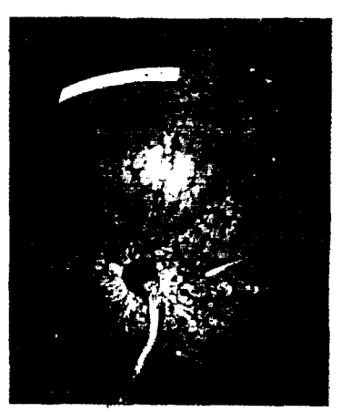
Fig 9 Low impedance lines (blue) and high percussion sound lines (red) determined on the body surface of melon.