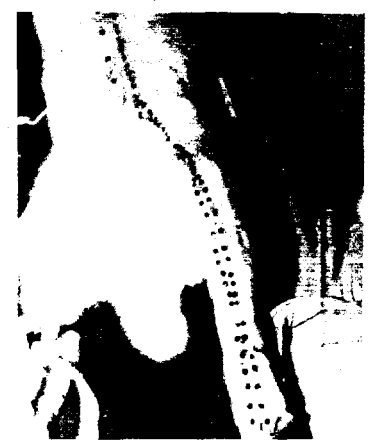
Fig 8 Experimental Meridian of Stomach determined by sound (red) and electric (green) me-