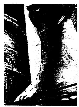
Fig 7 Photo shows the existence of low impedance (green) and high percussion sound (red) lines after