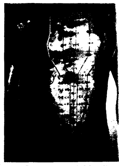
Fig 5 The Stomach Meridian (white) sculptured 960, years ago met closely with the experimental one (see Fig. 4)

Secondly, through the confirmation of the LIP and HPS characteristics of meridian line before and after amputation of patients suffered from osteoblastoma, Prof Zhu announced that acupuncture meridian is a distinctive and independent system from the central nervous or blood circulatory system. (Fig6.7)