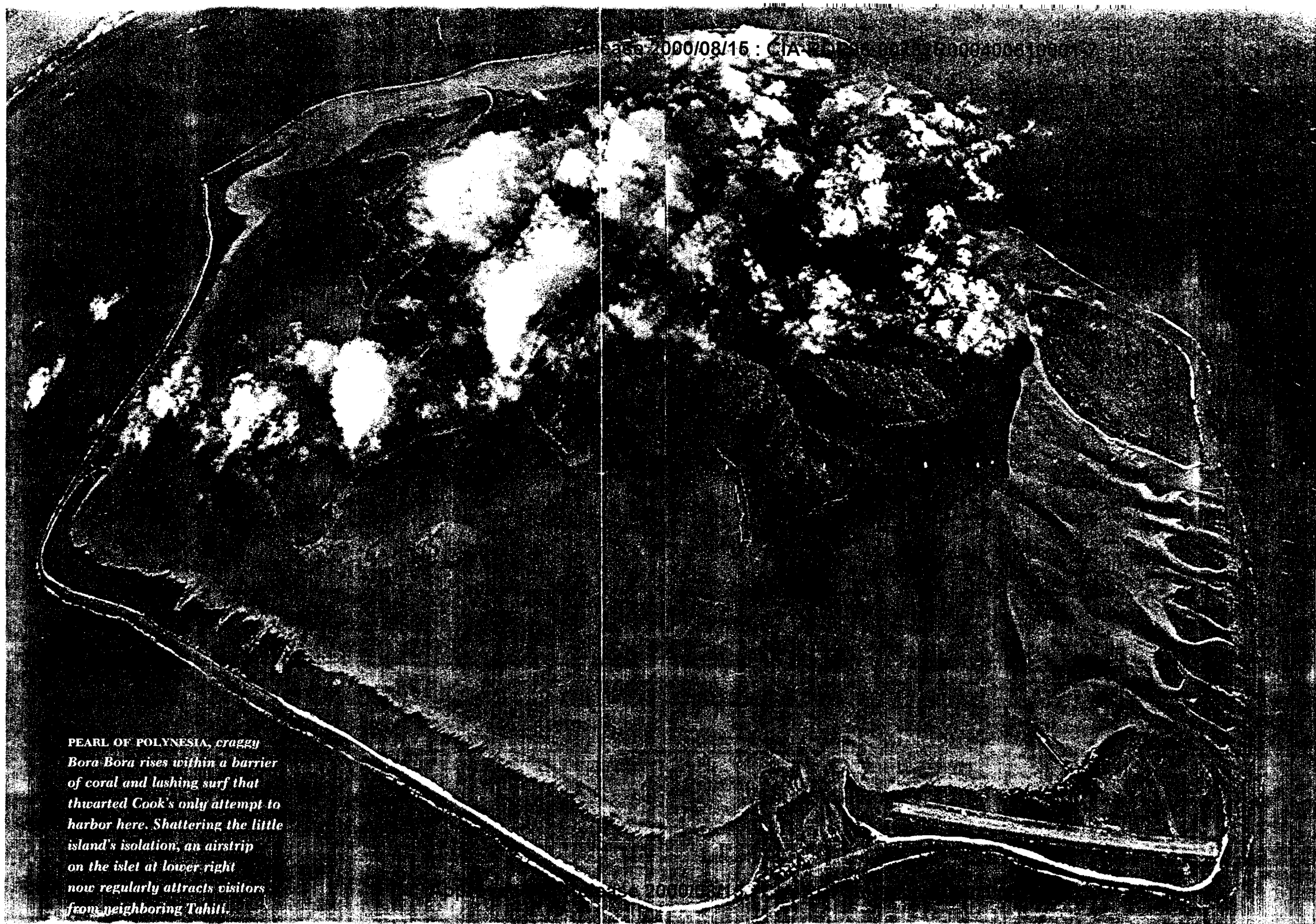
PEARL OF POLYNESIA, craggy Bora Bora rises within a barrier of coral and lushing surf that thwarted Cook's only attempt to harbor here. Shattering the little island's isolation, an airstrip on the islet at lower right now regularly attracts visitors from neighboring Tahiti.