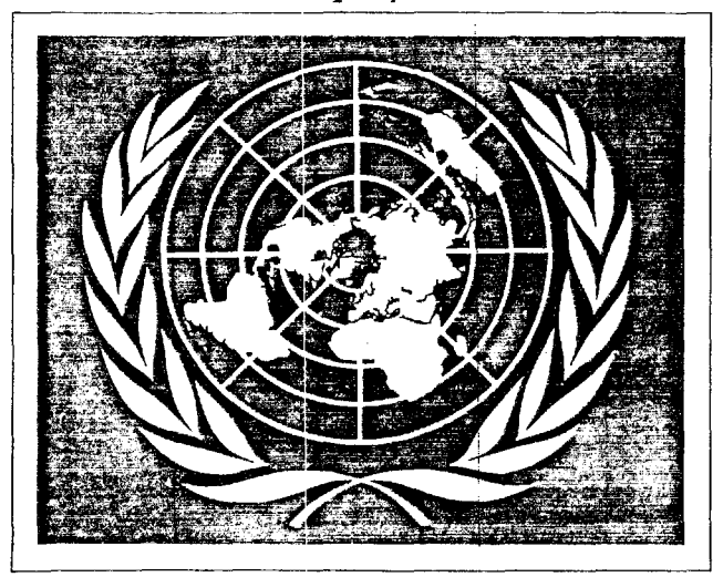
By Douglas Mattern

Although often maligned, misunderstood, and even maliciously used as a scapegoat by governments and uninformed individuals, the United Nations remains the only pivotal global force to move toward the world community that is imperative for our civilization to survive and move forward to the 21st century.