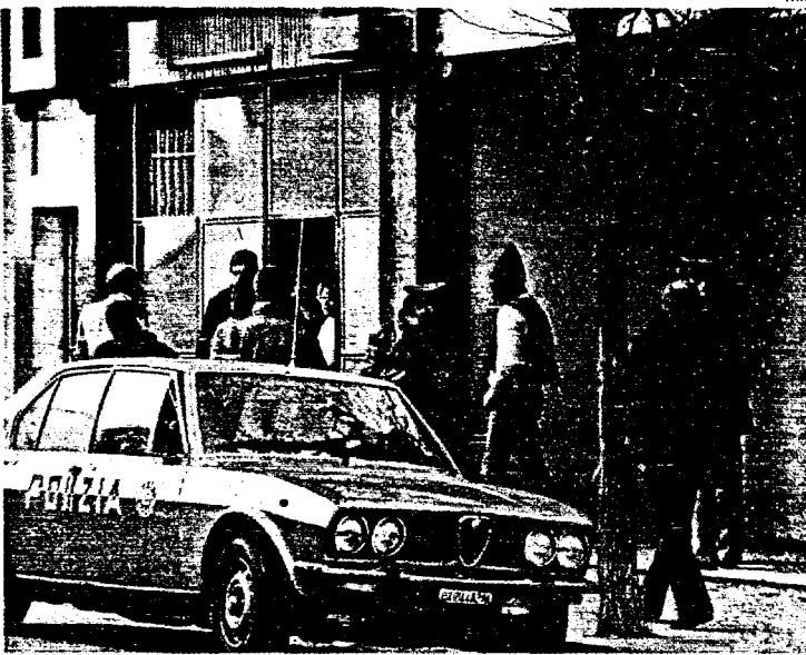
After the raid, police guard entrance to the Via Pindemonte building