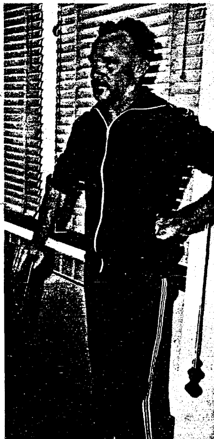
At Padua police headquarters after rescue