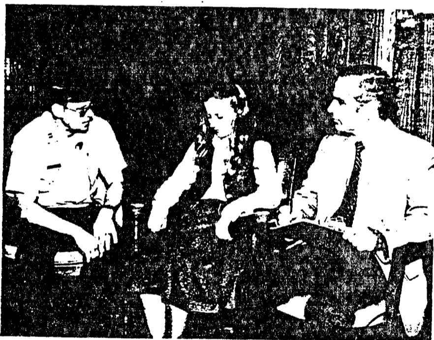
Figure 29-2 Mental Health Professional, Interviewee and Hypnosis Coordinator