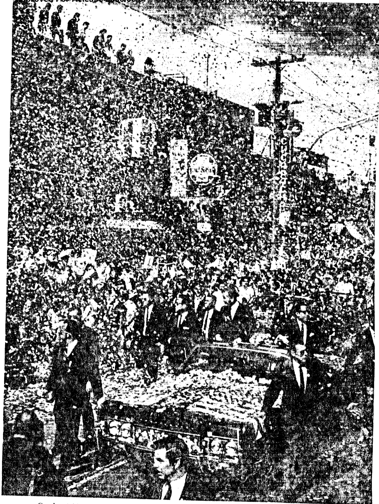
Good neighbors cheer a neighborly swap. Presidents Lyndon B. Johnson and Gustavo Díaz Ordaz ride through the confetti-filled streets of Ciudad Juárez on October 28, 1967. The festivities marked the end of a boundary dispute that arose in 1864, when the Rio Grande flooded and shifted its course. The