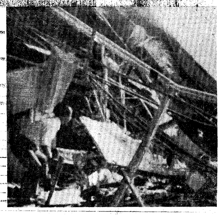
Employe of Honkin Department Store in Akita examines debris of adver-