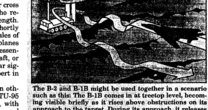
such as this: The B-1B comes in at treetop level, becoming visible briefly as it rises above obstructions on its approach to the target. During its approach, it releases an intense barrage of radar jamming. With the ground radar operators thus distracted, the B-2 sneaks in at high altitude, a position from which it can detect mobile targets, move in close, and destroy targets without being observed.

Special coatings also help suppress radar reflections. The SR-71, for example, is said to be painted with a radar ablative paint. This does not absorb radiation, but rather conducts it over the surface of the structure, cooling off hot spots that may develop at edges, corners, and other such places. The substance used on the SR-71 is called "iron-ball" paint, apparently because it contains microscopic iron particles to increase conductivity.