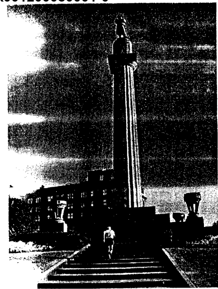
A statue of Robert E. Lee stands atop a 60-foot column in Lee Circle.