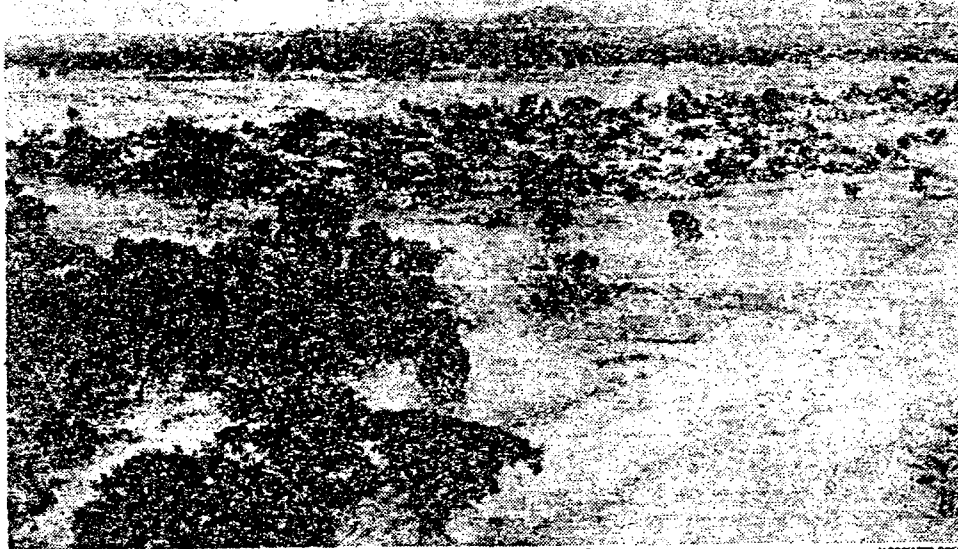
Mud surrounds and partially buries Armero, as seen from a nearby hill. The town center is inundated at lower right.