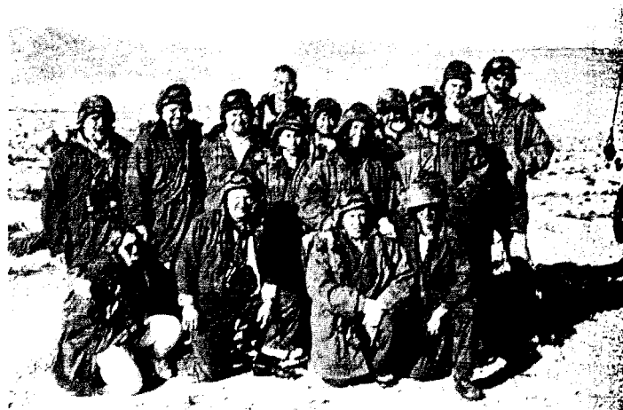
The NRC Committee on a site visit at the Army's National Training Center at Fort Irwin in the Mohave Desert.

Although the overall program has been funded all along by ARI, the concerns it addresses are widely applicable to a broad range of settings and populations in school and both public and private organizations, ranging from nuclear power environments to air traffic control towers.