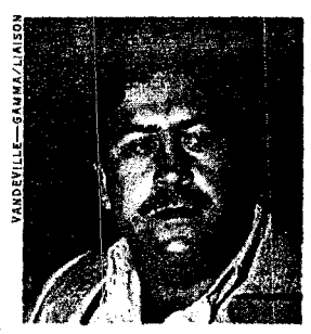
Pablo Escobar Gaviria. 39:

Wanted in America: Colombia's biggest narcobarons