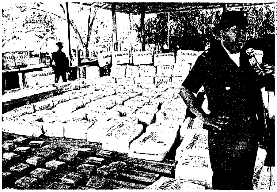
Colombian police commander with a cache of cocaine selzed in a government raid

Even more important, Colombian authorities in the first six months of 1989 seized more than a million gallons of processing chemicals such as ether and acetone—enough to make 320 tons of cocaine, almost the entire estimated yearly output of the cartel. It was the rubouts of Franklin Quintero and Superior Court