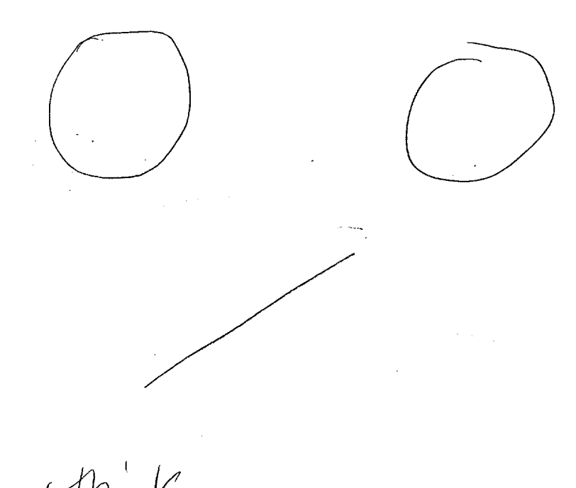
Mick Pat diagonal