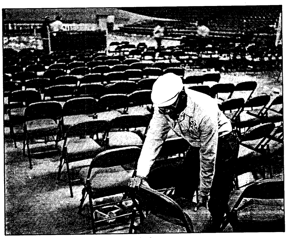
Grubb's crew moves quickly to clear out the Scope arena.

Events come and go at the Scope complex, often one right after the other, or all at once. To make things run smoothly it takes an experienced crew working with the precision of a finely tuned clock.