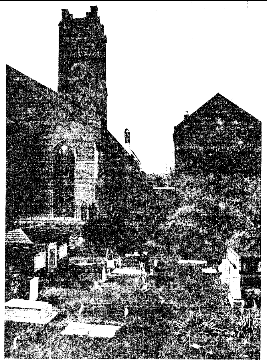
Westminster Burying Ground, in downtown Baltimore, holds the graves of many notable figures from the city's history.

somniae Tour that stops in the cemetery. Participants will visit the catacombs under Westminster Hall, which was once used as a church, and have a glass of sherry during a poetry reading of "Annabel Lee" at