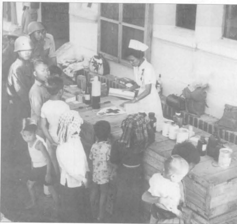
Operation Brotherhood open its Camau clinic on packing crates in front of the schoolhouse it later occupied, as national security troops rolled in for "Operation Liberty." These Filipinos kept the clinic open 24 hours a day (caption by Ed Lansdale).