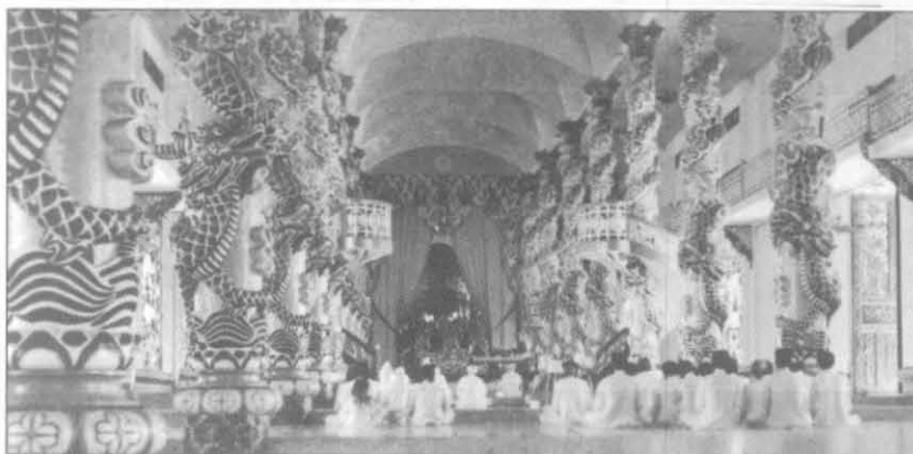
Cao Dai temple at Tay Ninh.

General The confirmed his support for the government, agreed not to take any uncoordinated military initiative against the French, and released his French prisoners. 14 [redacted]