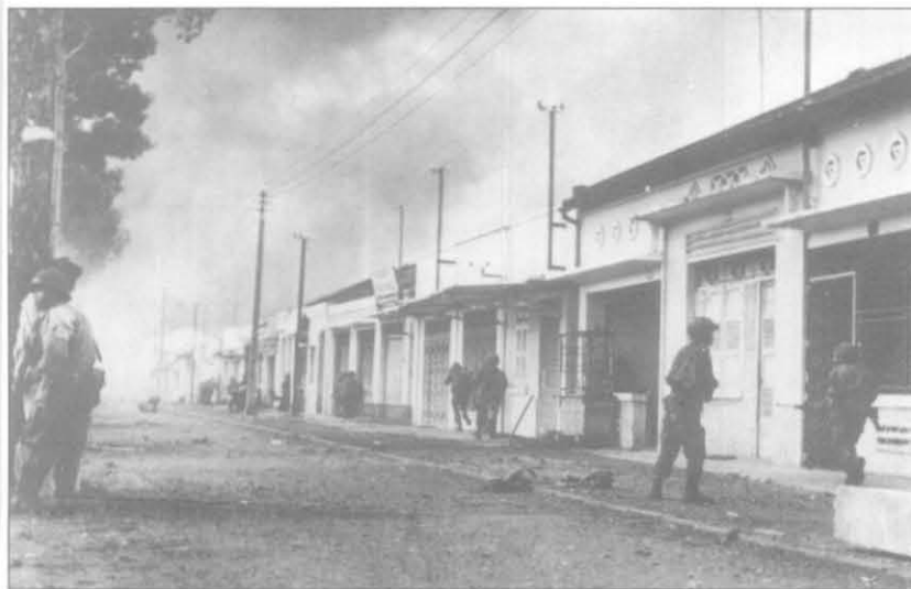
The battle for Saigon, April 1955.

Agency's preeminent authority on Vietnam. Wittingly or otherwise, Lansdale lent that authority not only to his own reporting but to that of the regular Station. In so doing he became the largest single influence on deliberations in Washington at the most critical point of Diem's tenure before 1963. 24