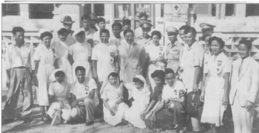
President Diem at Operation Brotherhood Clinic, c. 1955.