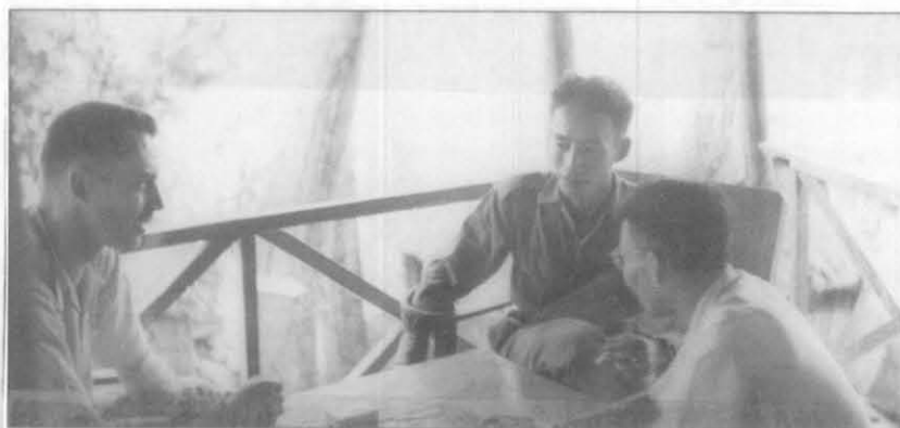
First meeting with Trinh Minh The in his Nui Ba Den hideout. Lansdale at left, Trinh Minh The is facing camera (caption by Ed Lansdale).

General The confirmed his support for the government, agreed not to take any uncoordinated military initiative against the French, and released his French prisoners. 14 [redacted]