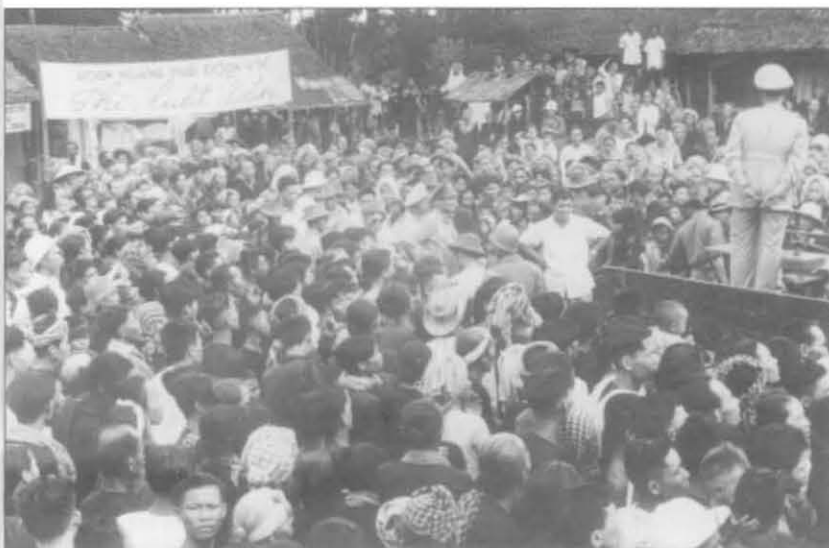
Town of Long Kuyan, center of pro-government Hoa Hao Army, turning out to welcome Operation Brotherhood. Note sign "Phi Luat Tuan," which means "Philippines" in Vietnamese.