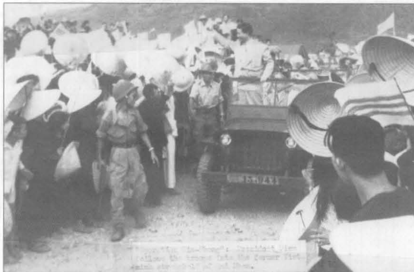
Operation "Gia-Phong:" President Diem follows the troops into the former Viet Minh stronghold of Qui Nhon.