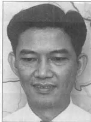
Ngo Dinh Nhu.

accounts of the period suggests that anyone but Diem set the government's priorities or that Nhu played any role but that of executive agent. Indeed, found Nhu diffident at first about making even routine operational decisions; his impulse was always first to consult Diem. 12