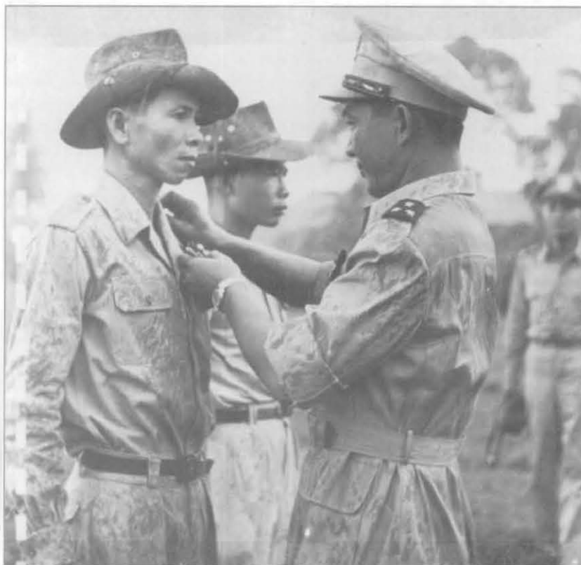
General Dinh makes Hoa Hao rebel Ba Cut a National Army colonel during the Diem-Dinh struggle (caption by Ed Lansdale).—

80,000 to 90,000 Viet Minh were headed north. An unknown number of cadres was left behind, but the Viet Minh administrative apparatus that had controlled substantial areas in the South was largely if provisionally dissolved. Prime Minister Diem now had to replace that apparatus with his own. Things were not much different even where the Viet Minh had not set up a formal administration of their own, as only about 20 percent of the colonial bureaucracy resided outside Saigon, with nearly all of that in the provincial capitals. 37