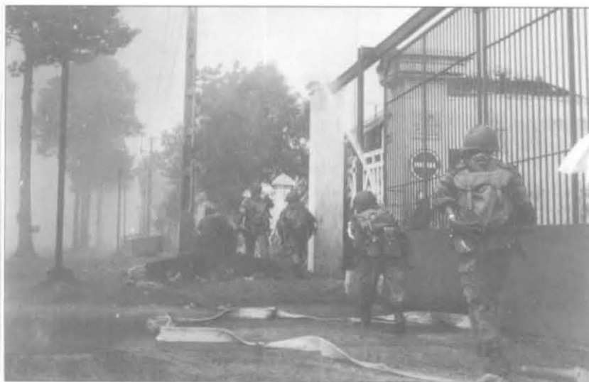
The battle for Saigon, April 1955.