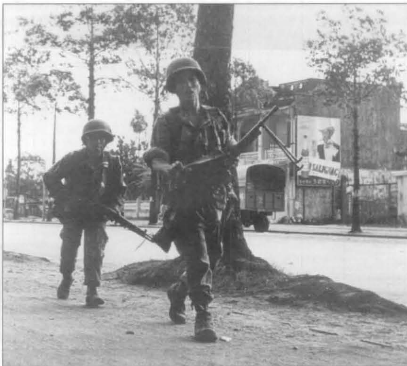
April 1955: Decision in Saigon-Cholon. (Caption by Ed Lansdale).