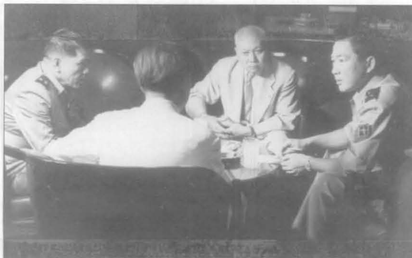
Drama during Diem-Hinh struggles. Diem and power-seekers Binh Xuyen's Bay Vien, ex-President General Xuan, Chief of Staff General Hinh (caption by Ed Lansdale).

aspect. Nevertheless, the atmosphere of crisis that provoked it illustrated the preoccupation of the US Mission with the regime's fragility. 35