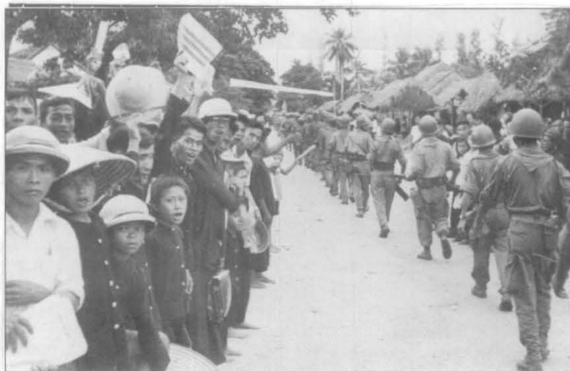
Operation "Gia Phong:" troops of the National Army's 31st Division entering a Binh Dinh village. One result of this "national security action:" young people returned from the hills (captions by Ed Lansdale).