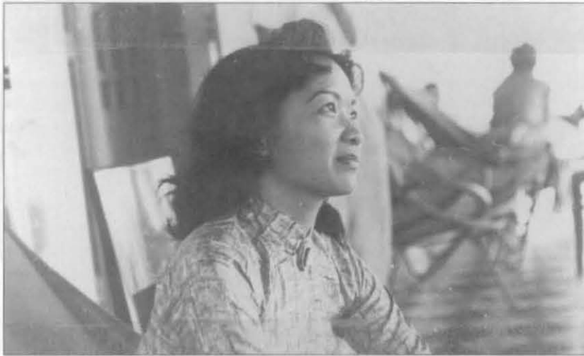
Madame Nhu.