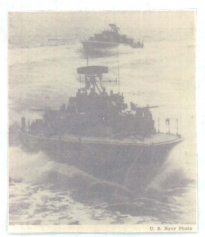
Faded newspaper clipping of patrol boat of the type intended for sabotage operations in North Vietnam.

With an acceptable aircraft in the inventory and the Swifts and Nastys on the way, the Agency used the summer of 1963 to experiment with various technological fixes to the problem of inserting and supplying teams within striking distance of their targets. The scarcity of suitable drop zones, in particular, sparked efforts to deliver men and materiel with greater precision, in more difficult terrain, and in areas posing greater danger to the program's aircraft. Saigon wanted devices permitting low-altitude opening of chutes for supply bundles dropped from high altitude. It also asked for beacons, to be attached to cargo bundles, that could be