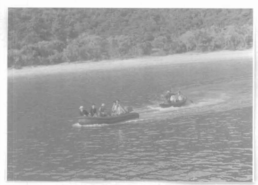
Under tow is the sampan that