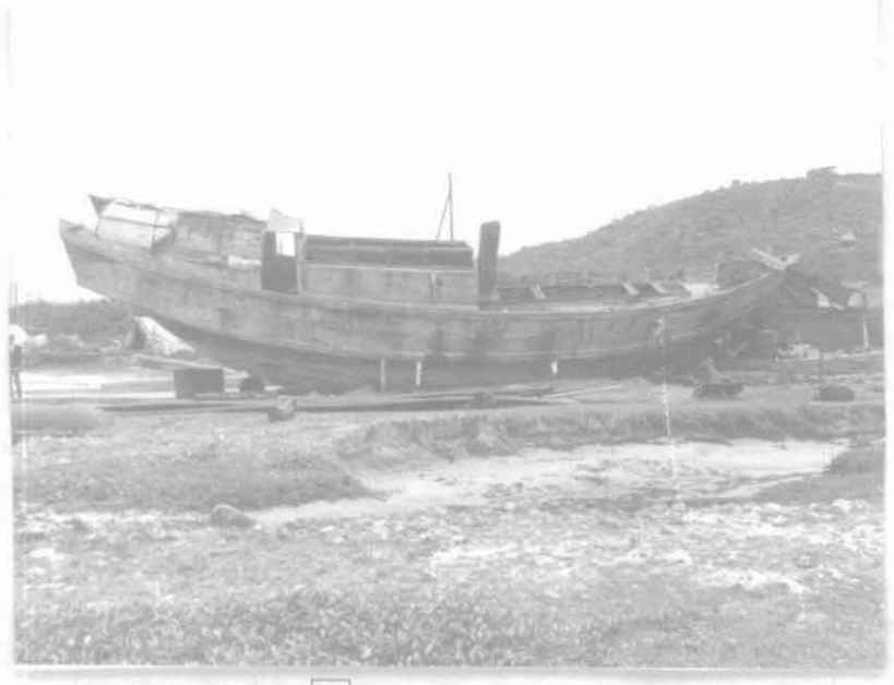
Infiltration junk Nautilus I

results of a "definitive study," it was proceeding with the agent material at hand.4