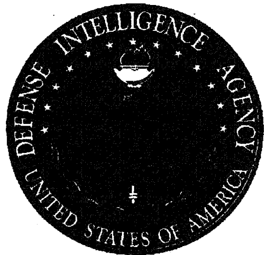
(U) DIA Seal

Documented successes from numerous joint task forces and enclaves proves that collocating highly skilled experts from multiple disciplines, and fostering an environment that encourages them to work in partnership, results in exceptional outcomes. LTG Flynn created Vision 2020, a task force constructed to