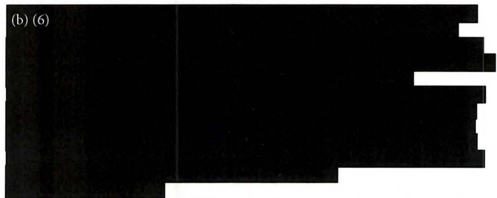
Subject: FOUO\\Command Post Notifications - PA note

This e-mail contains FOR OFFICIAL USE ONLY (FOUO)